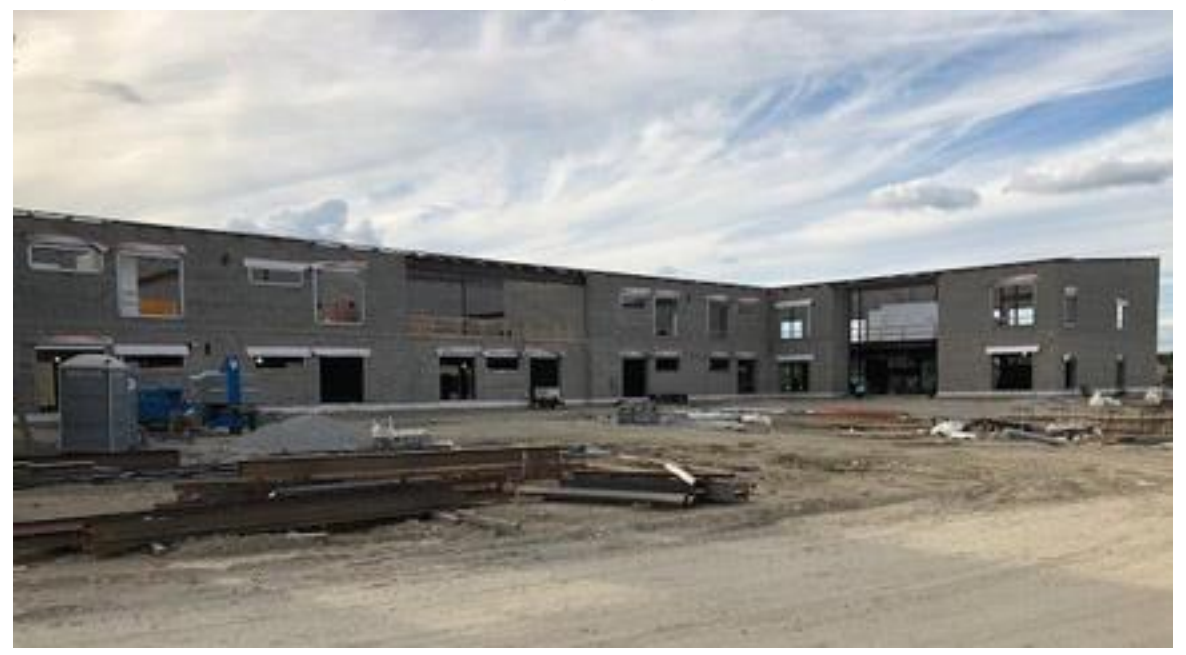
• The Jr./Sr. HS lunchroom had some windows installed and the auditorium block work has begun.

• Elementary school progress is coming along quickly.