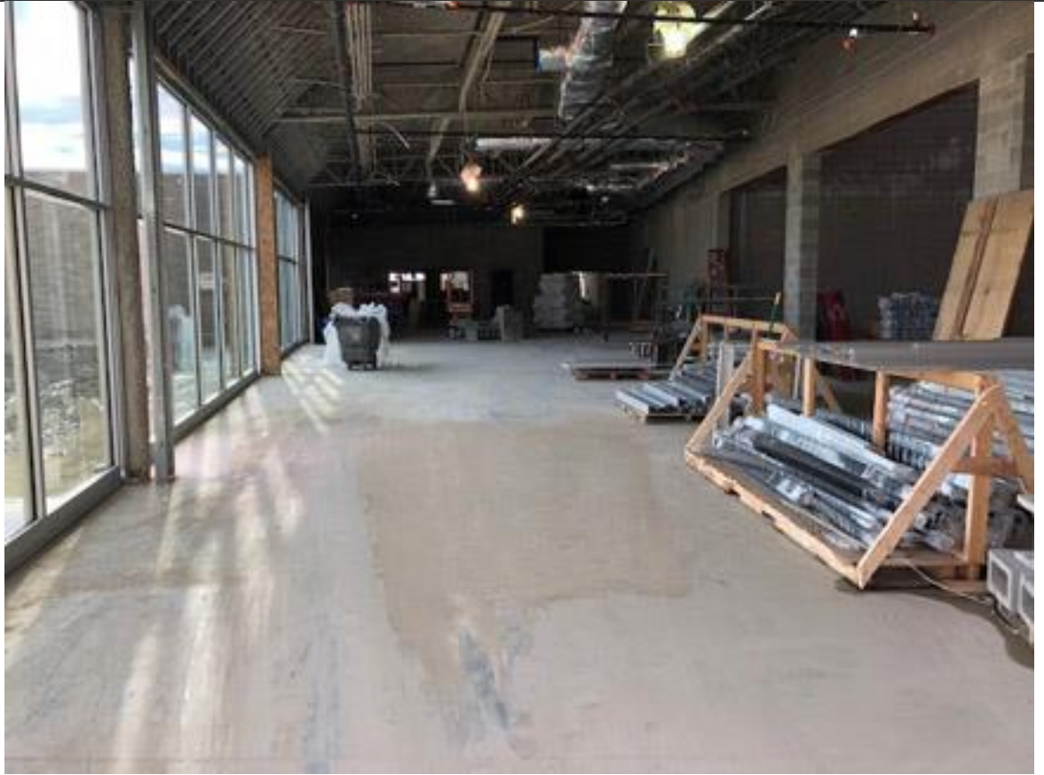
• A view of elementary wing.