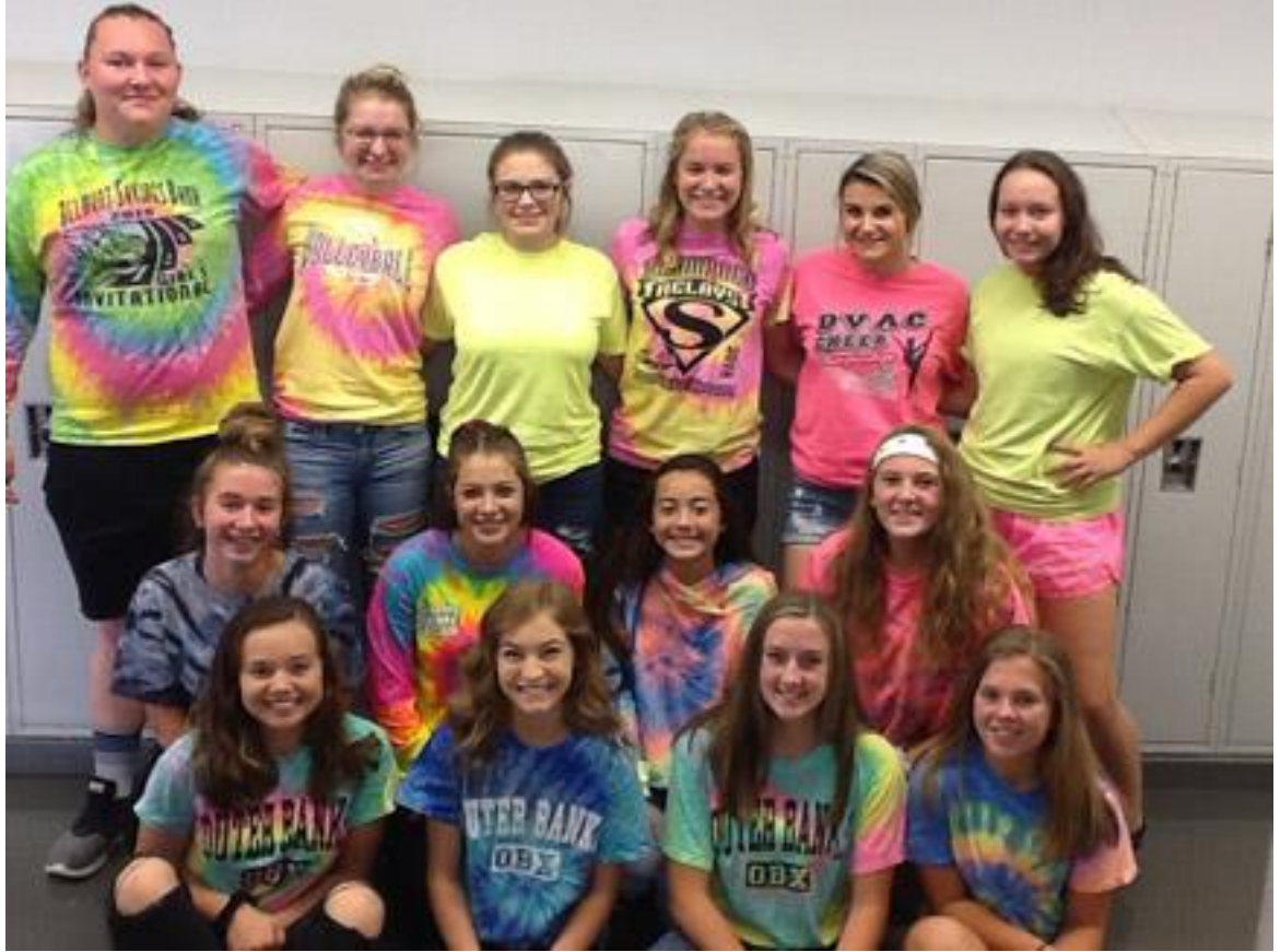
• Harrison Central has some bright students! Neon/tie-dye day of Homecoming week was a success!